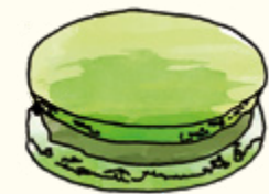
Moroccan Mint Tea