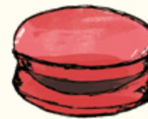
1837 Black Tea & Blackcurrant