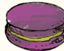
Grand Wedding Tea, Passion Fruit & Coconut