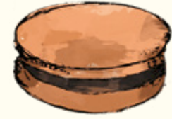
Earl Grey Fortune & Chocolate