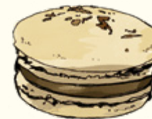
Vanilla Bourbon Tea & Blackcurrant