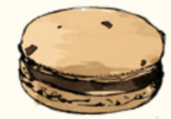
Number 12 Tea & Tiramisu