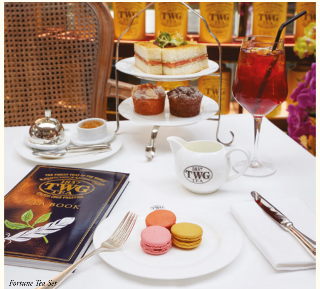
Fortune Tea Set