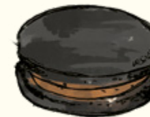
Napoleon Tea & Caramel