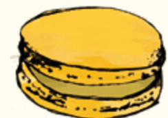
Lemon Bush Tea