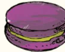
皇家婚禮茶 佐以百香果和椰子