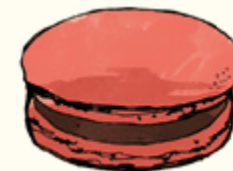
Bain de Roses Tea