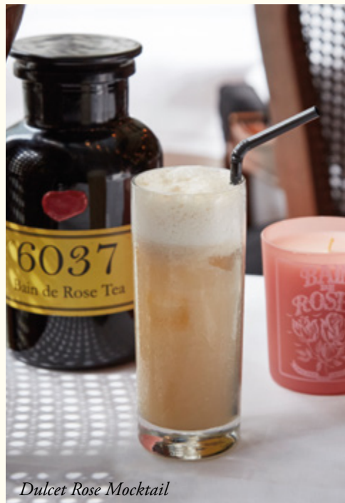
Dulcet Rose Mocktail