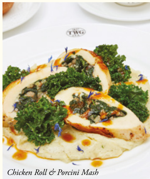
Chicken Roll & Porcini Mash

Free range chicken breast stuffed with mushrooms, spinach and bacon drizzled with a chicken jus, accompanied by wilted chayote leaves and porcini mushroom potato mash infused with Pu-Erh 2000.